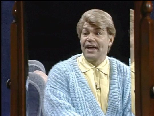
SNL: "Stuart Smalley"

Reaction #1: "True BUT I'm not that bad! I'm basically a good person."