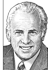
John MacArthur "The Loving Father" December 2005

"What is God running for? Why does He bring shame and scorn on Himself for exposing Himself? It's just shocking. The reason: The Father runs taking the shame to protect the son from taking the shame. He takes the scorn, and the mockery, and the slander so that his son doesn't have to bear it."