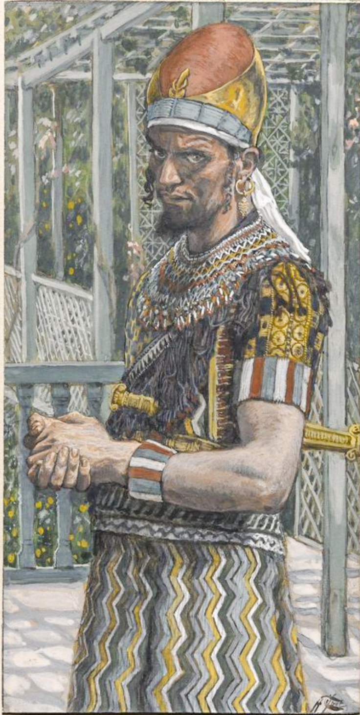
Herod Antipas 21 bc – ad 39 Ruler of Galilee